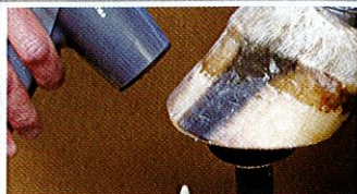
dry the hoof wall