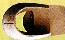
DALLMER Flaccidity Shoe