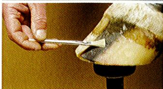
degrease with ether

Already while working on the hoof, it is recommended to heat the hoofshoe together with the glue ( without proportioning nozzle ) inside the packing case with the help of a hairdryer to approx. 40°C.