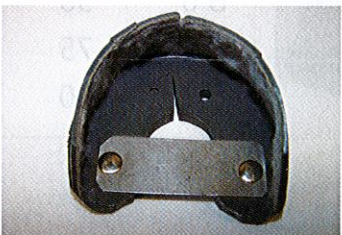
individual fitting possible by use of metal strap

Open the cartouche on the line marked on the neck, let a few drops drip out, fix the patented DALLMER Proportioning Nozzle and turn it about half a turn clockwise (or mix the glue inside a cup). Spread the adhesive swiftly onto the felt-coated inner wall of the hot shoe. Slip the shoe immediately onto the hoof and wrap a self-adhesing crape bandage around it. After that the hoof can be put down. It has been proven to be favourable to heat the freshly glued hoof for 2 minutes with a hairdryer ( in wintertime this is imperative ).