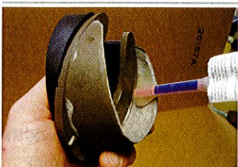
screw on the assembly wedge and apply glue

To achieve the best possible glueing result, at first the hoof wall gets carefully rasped with a width of approx. 3 cm and degreased with ether . After that the hoof wall needs to get warmed with a hair dryer. This is important. After that, please don't touch the area anymore with your fingers.