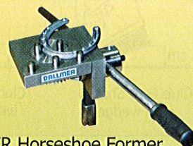
DALLMER Horseshoe Former