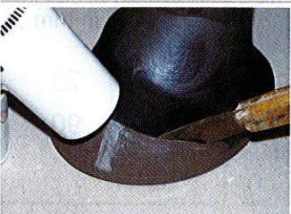
remove the pre-warmed shoe carefully with putty knife or toeing knife

The shoes get supplied in standard sizes. If the shoe doesn't fit snugly it can be widened or narrowed with the included metal strap.